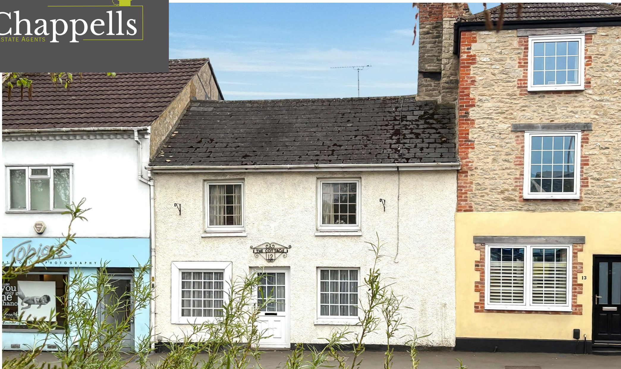
The Cottage, 12 Newport Street, Old Town, Swindon, SN1 3DX